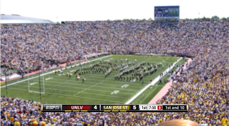
DATA CAN BE SENT DIRECTLY TO NEWTEK™ LIVETEXT™ CHYRON™, COMPIX™, SCOREBOX™, TV-GRAPHICS™ AND SPORTS MEDIA™.

THE DATASTREAM FROM SCOREOCR™ IS TRANSCODED THROUGH THE INCLUDED SCOREBRIDGE™ APPLICATION, AND DELIVERED TO THE RENDERER OR DISTRIBUTION PLATFORM OF YOUR CHOICE.