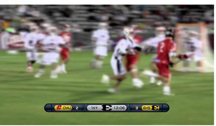
ALSO AVAILABLE WITH VIRTUAL "DAKTRONICS" COMPATIBLE DATA FEED

NEED THE ULTIMATE IN PORTABILITY? CHECK OUT OUR SINGLE INPUT LAPTOP VERSION, SCOREOCR™-USB3.O.